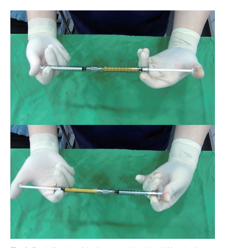
Fig. 1. Emulsification of the fat was achieved by shifting the fat between two 1 cc syringes connected to each other by a female-to-female Luer-Lok connector.

First, microfat grafting was performed in part of the nasojugal groove. This was followed by nanofat grafting toward the upper part of the groove. The nanofat grafts were injected into the subdermal layer using a 20-gauge blunt cannula, inserted through a small incision approximately 2 cm below the lateral canthus. Injection continued until a smooth contour with the microfat-grafted area was achieved. The mean volume of microfat graft for each