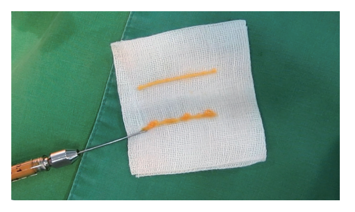
Fig. 6. A mock injection with nanofat (upper) and microfat (lower). Nanofat could make more regular, finer particles of fat than microfat with the same cannula.

ies of microfat grafting techniques using thin cannulas, Tonnard et al. used even thinner needles, as small as 27 gauge [5]. By contrast, we used a blunt cannula instead of a sharp injecting needle. In Tonnard's cases, whitish discoloration remained for 1 month postoperatively and eyelid skin was erythematous for 3 months after the procedure. We considered these recovery times to be too long for actual clinical cases, so we decided to avoid intradermal needle injections.