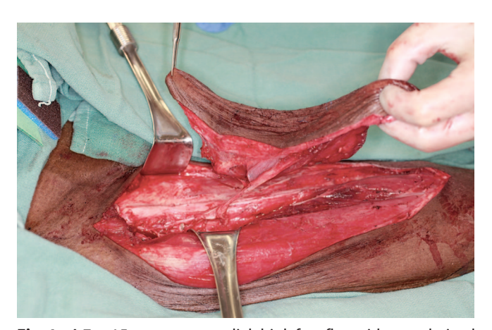
Fig. 1. A 7 \times 15 -cm anteromedial thigh free flap with vascularized fascia and a 10-cm section of sartorius muscle supplied by the rectus femoris branch of the lateral circumflex femoral system.

We present a 67-year-old man with the recent diagnosis of a nearly obstructing T3N2M0 squamous cell carcinoma of the larynx that required emergent tracheostomy. The patient's medical history included myocardial infarction, congestive heart failure (ejection fraction, 28 percent), severe atherosclerosis with carotid stenosis following endarterectomy, emphysema, peripheral vascular disease, and severe malnutrition with a body mass index of 15. Tumor ablation resulted in bilateral neck dissection, a nearly circumferential defect of the hypopharynx, a cervical esophagus 9 cm in length, and part of the base of tongue, and a lower neck skin defect. Note that we prefer to incorporate a posterior strip of the pharynx, 2 cm in this case, into a reconstruction when available to help prevent stricture formation.<sup>2</sup> A standard anterolateral thigh flap was designed and the thigh explored; however, only an extremely small insufficient perforator B was present. Further exploration of the medial thigh demonstrated two large-caliber (>1 mm) musculocutaneous perforators, B and C, through the sartorius muscle. This perforator was traced back to its main vessel, which originated from the